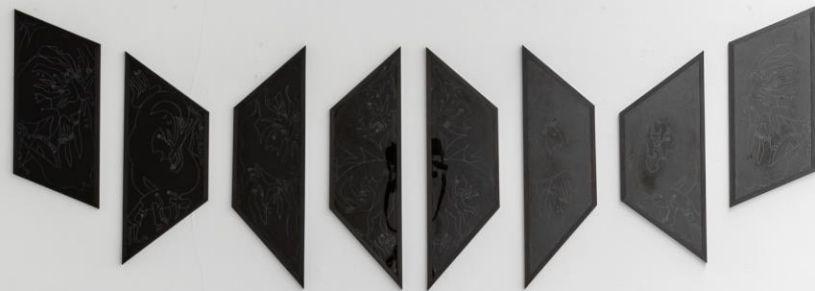
Milena Naef Mirror, mirror, on the wall, who is the worst mother of them all? 2024 Glass, wood 80 x 194 cm ca