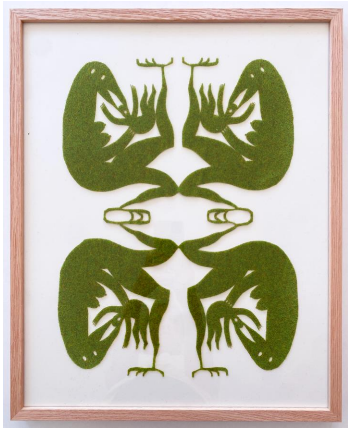
Milena Naef Muttermahl in grün #3 2024 Flocked paper, wooden frame 51 x 41 cm