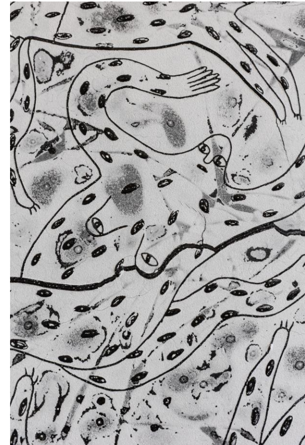
Milena Naef, Die Befleckte (The Stained One) , detail, 2023

With clever references to fairy tales and technology, she introduces us to a magical universe made of ancestral symbols, animals, and hidden messages. Her glass works transfer drawings: in one, new crack lines are integrated through the firing process, loosening up and continuing the creative flow. In the other, the slick, shiny surface of the glass displays engraved and meticulously planned drawings.