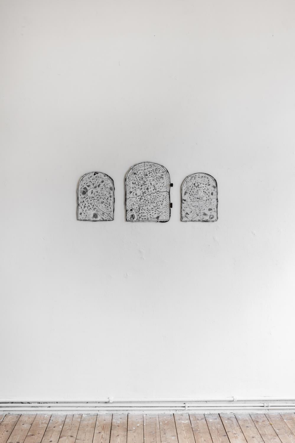
Milena Naef Die Befleckte (The Stained One) 2023 Glass, patina 41.5 x 98 cm