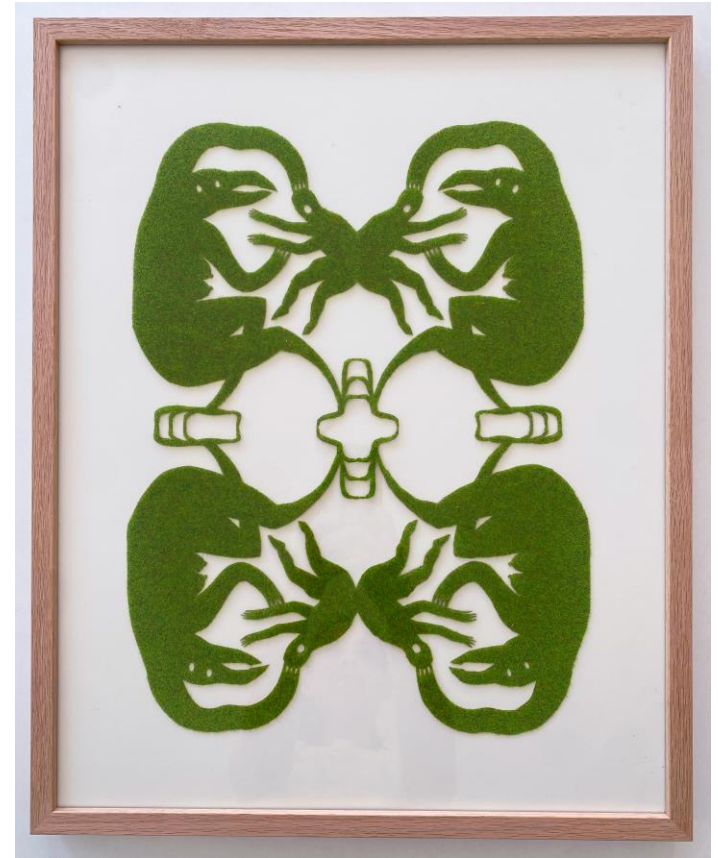
Milena Naef Muttermahl in grün #4 2024 Flocked paper, wooden frame 51 x 41 cm